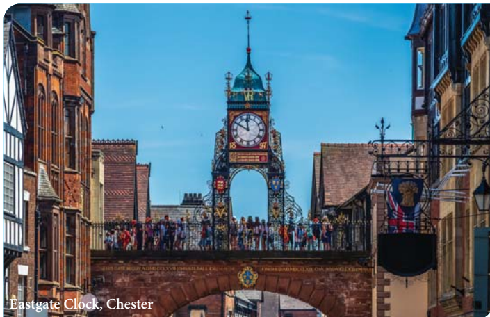
Eastgate Clock, Chester

Join us on this unforgettable five-day journey through the heart of England's rich historic and industrial landscape. From stargazing and cutting-edge science at Jodrell Bank, to walking the remarkably preserved Roman walls of Chester, admiring the timber-framed Tudor charm of Little Moreton Hall, and marvelling at the impressive engineering of the iconic Anderton Boat Lift, this tour offers a captivating mix of iconic and culturally significant sites. With expert local guides, hands-on experiences in immersive museums, we'll also explore grand country estates, ancient salt works that shaped the region's economy, and the intricate artistic legacy of silk weaving in the historic market town of Macclesfield.