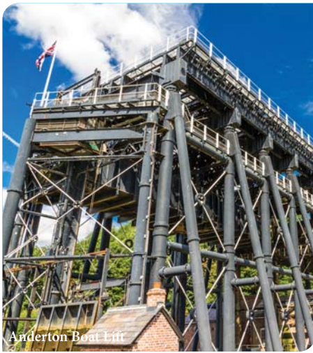
Anderton Boat Lift