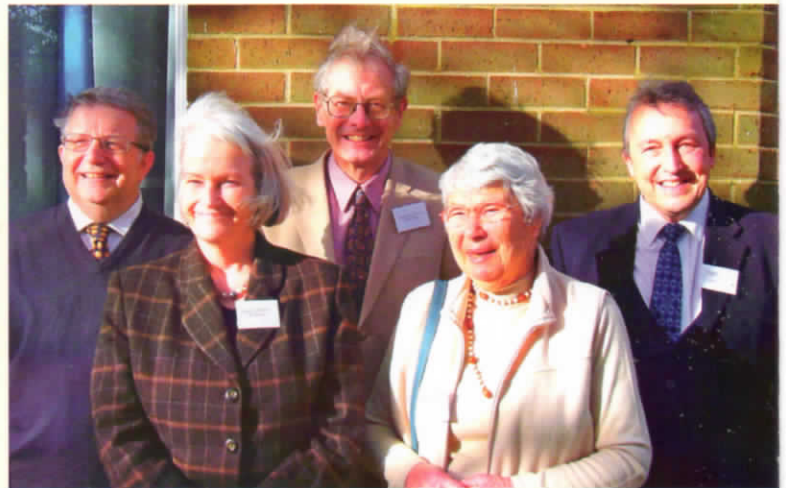
Speakers at Antiquarians and Architects.

Members of the Team helped with the Society books at Heckington Show and are involved with the county project about War Memorials. They are also the Society's representative on the county recording steering group and are working on the Leach deposit of files at Jews' Court.