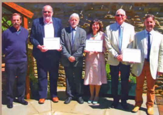
Award-winners at the 2013 AGM.

Market Rasen - All Our Stories. Virtual heritage tour.