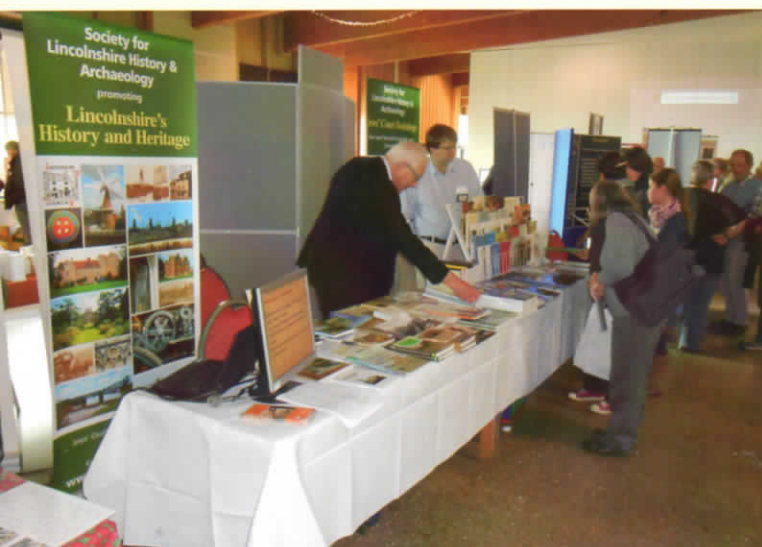
In October the Society presented talks and ran a bookstall at Echoes of the Past at the Lincolnshire Showground.