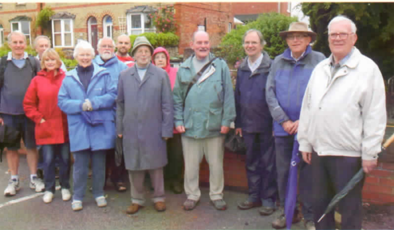
The Sleaford Group's annual walk in June.

Sleaford has had another varied and informative programme of talks by a wide variety of speakers.