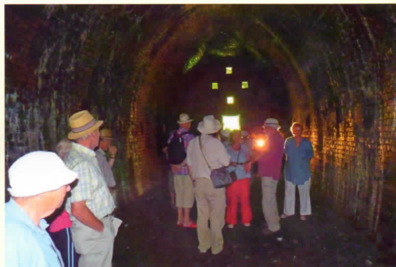
The picnic at Withcall provided a rare opportunity to enter the railway tunnel.

We have taken into safe custody the Peter Grey photo collection. This comprises approximately 23,000 photographs, negatives and slides. Its value to the County was identified following the "Made in Lincoln" Millennium celebrations and it would have been lost if we had not acted. Work on sorting through it continues and the first tranche has been lodged with the County Archives.