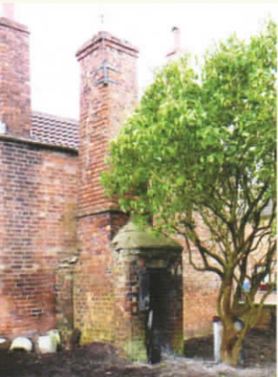
The Horncastle Tyre Oven. Now a listed building following action by the Industrial Archaeology Team