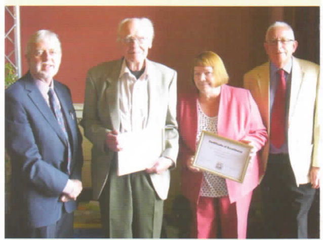
Award winners representing Pickworth and Saxilby with the President and Chairman

Joseph and his Round the World Dreamboat. Musical play about Sir Joseph Banks