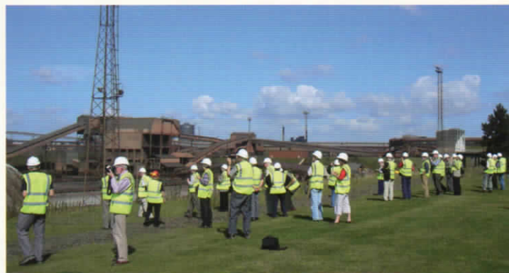
The national AIA Conference, hosted by SLHA, included 12 full day tours, one of which was to the Corus steelworks in Scunthorpe