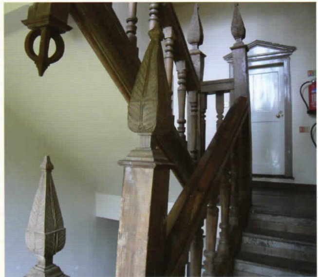
Following the 2009 AGM of the society in Bourne, an afternoon visit was arranged to Red Hall