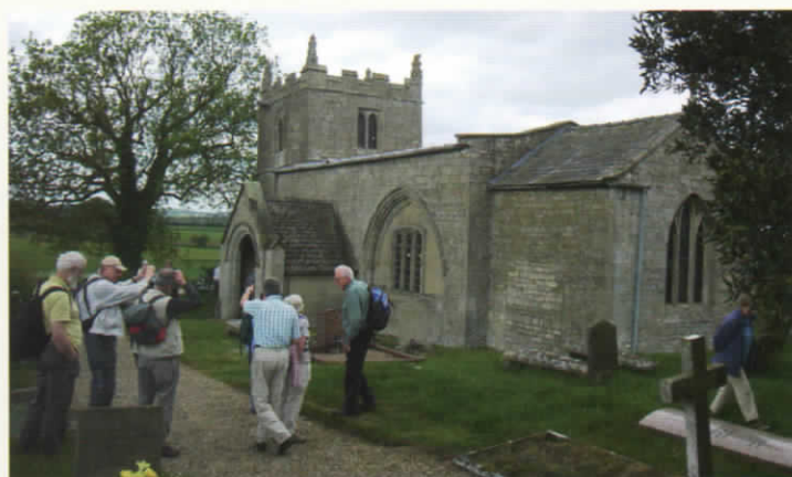
In early May 2009 an SLHA group walked along the Sleaford navigation towpath to Evedon Church