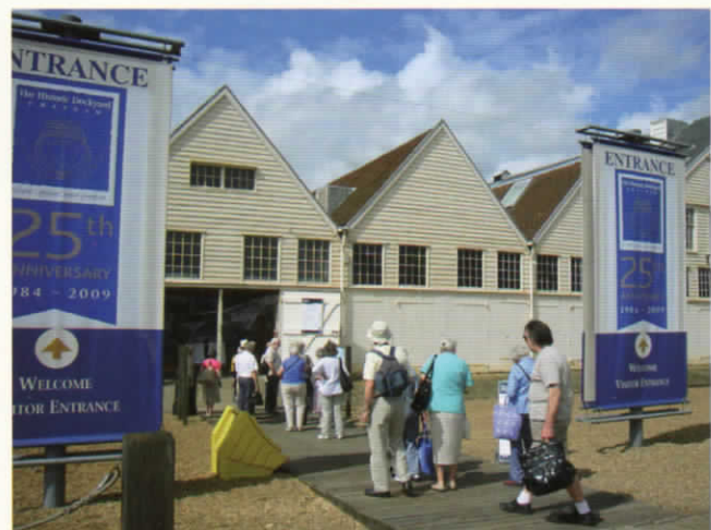
Members on the July 2009 Study Tour to Kent arriving at Chatham Dockyard

The Group is now an established part of the South Holland cultural scene and the friendly meetings foster an interest in the history of Lincolnshire, and South Holland in particular. Despite the Group's popularity there are problems in recruiting officials.