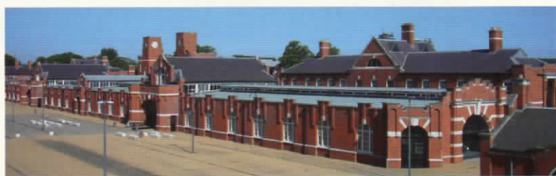
The impressive former Chatham Naval College, base for the 2009 SLHA Study Tour