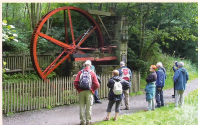
Examining Armstrong's waterwheel at Cragside, Northumberland