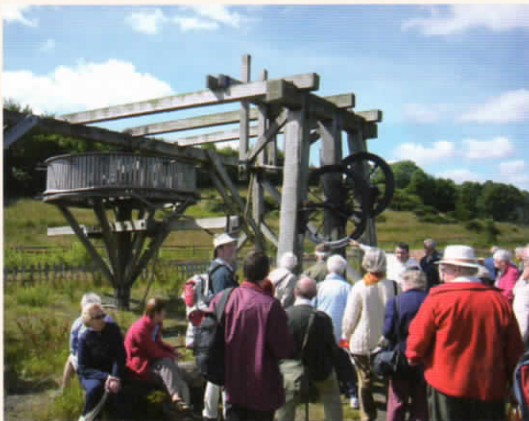
Members view a horse powered winding engine on a trip to Beamish in July