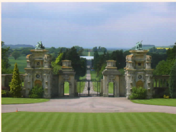
Society visit to Harlaxton Manor in July