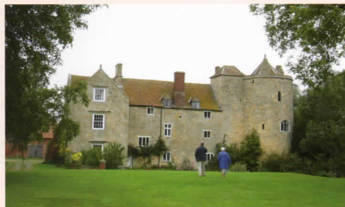
Somerton Castle, Boothby Graffoe – The Society sponsored a geophysical survey at the castle during August

Society for Lincolnshire History & Archaeology Jews' Court 2-3, Steep Hill Lincoln LN2 1LS