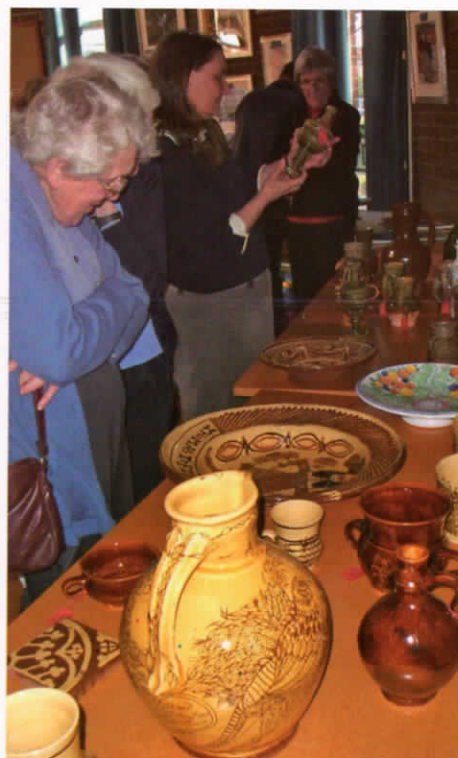
Reproduction medieval pottery on display at the Crafts and Craftsmen weekend held at Horncastle in February 2008