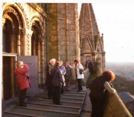
Participants in the Horncastle Crafts and Craftsmen weekend, held in February 2008, visit Lincoln Cathedral

The Local History weekend held at Horncastle College in February 2008, was as instructive and enjoyable as ever. The topic of 'In the Making - Crafts and Craftsmen' was covered by some excellent speakers who enthused about medieval glassmakers, stone masonry, masons' marks, medieval tiles and English pottery from medieval times to modern master-craft. The possible origins of the Epworth Chest were considered from Hamburg