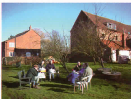
Members of the Industrial Archaeology Team take a well earned break during the survey of Holdingham watermill

We have kept up a flow of speakers for our talks and articles for our publications, and produced two books for publication, as well as organising two conferences. We have objected to two planning applications in Lincoln and have completed the recording of Holdingham Mill. The raising of the profile of the RB dragline machinery for fen