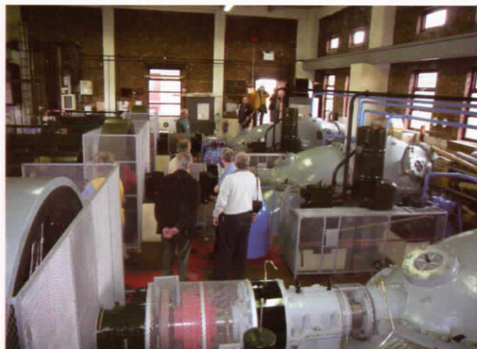
A visit to the Lade Bank Pumping Station arranged as part of the East Midlands Industrial Archaeology Conference weekend held in May 2007

drainage is being worked on. The Society has accepted a gift of a large number of old Ordnance Survey maps and we have started to catalogue these to enable decisions to be made as to their future. Our enthusiasm is expressed in the number of people in the Team