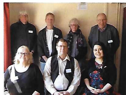
Speakers at the 'Lincolnshire Reimagined Conference' held at Welton Village Hall.