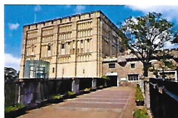
Norwich Castle, the subject of the first 'live talk' of 2023.