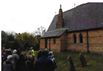
Members of the Society on a visit to St Helen's Church, Little Cawthorpe