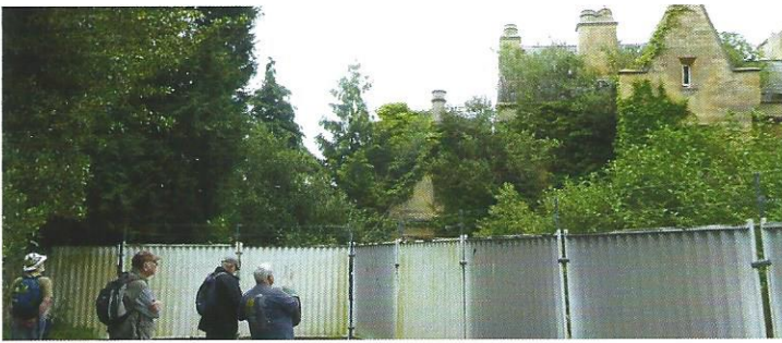
Members of the IA Team on an informal walking tour around Nocton village led by Stewart Squires. The photo shows Nocton Hall

Chesterfield Canal; Gringley on the Hill to West Stockwith, indicated the canal to be in good order. The eastern end of the Sleaford Navigation, South Kyme to Chapel Hill, where the Navigation joins the River Witham, was also visited.